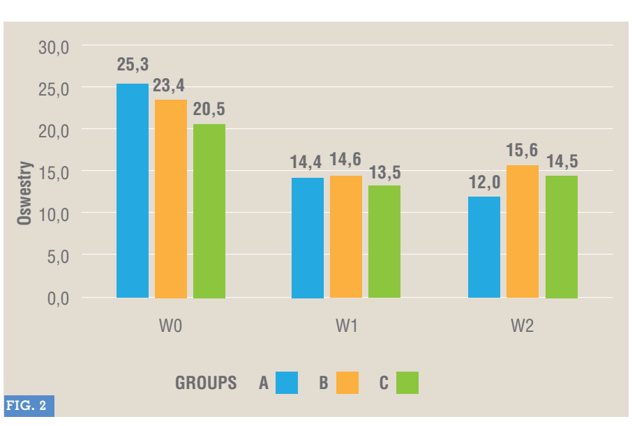
Average Oswestry questionare values at control points.