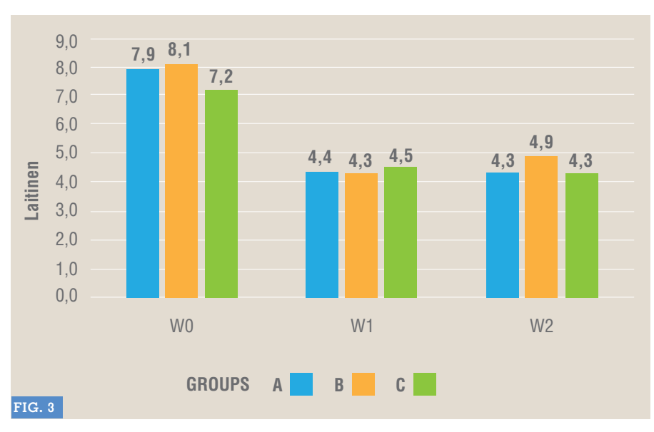
Average Laitinen questionare values at control points.