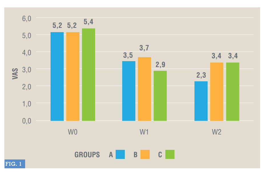
Average Visual Analogue Scale (VAS) values at control points.

The detailed characteristics of the study